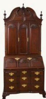
MAHOGANY SECRETARY DESKS Make work-from-home feel refined and productive.