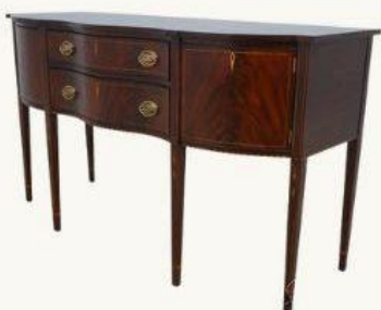
HENKEL HARRIS SIDEBOARDS Beautifully crafted, ideal for dining rooms or entryways.

Give your home a sophisticated edge with antiques that blend warmth and tradition. This month's highlights include: