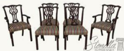
CHIPPENDALE STYLE CHAIRS Classic and comfortable with a stately silhouette.